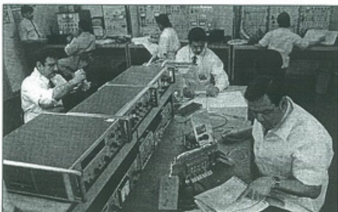
Final inspection and shipping area.

Honor Award winner Tactical Inc., Miami, Florida, is a new entrant in the competitive field of avionics repair.