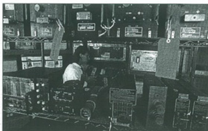
Tactical's main shop.

A t its facility near the Miami International Airport, Tactical Inc. offers depot-level overhaul, certification and modification of avionics, accessories and instruments (including digital databus systems).